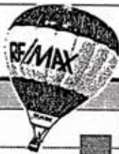
North American sales associate growth

Re/Max is one of the nation's fastest growing real estate franchise firms.