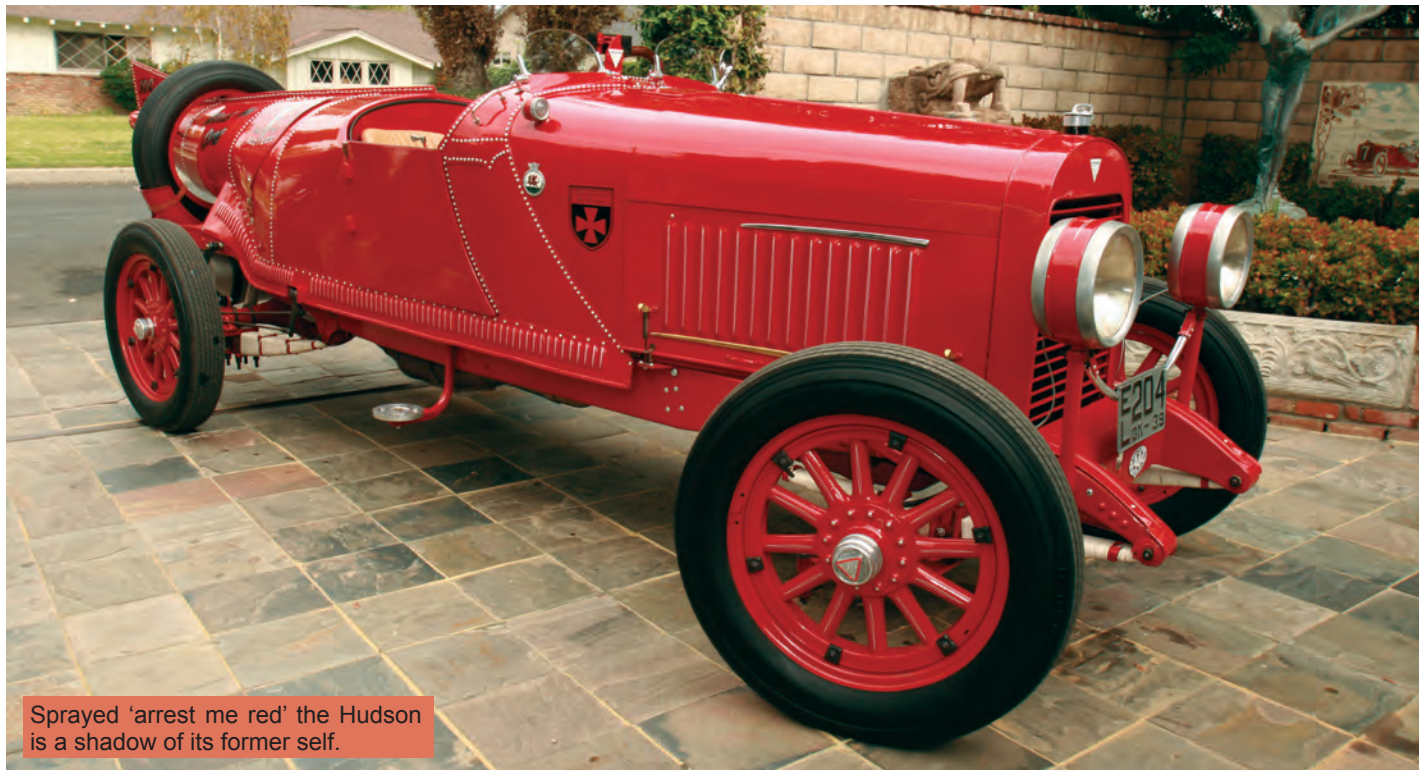
Sprayed 'arrest me red' the Hudson is a shadow of its former self.