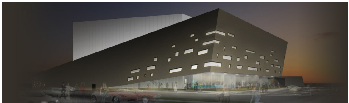
Wagner-Noel Performing Arts Center—MOSC's new home for performances.

We support, promote, and enhance cultural and musical appreciation by educating the community and financially supporting the Midland-Odessa Symphony & Chorale.